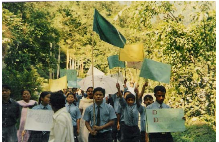
Students performing rally on Environmental Awareness