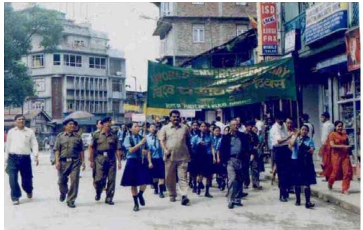
World Environment Day 2006: Hon'ble Minister (Forests) leading the street rally at Namchi, South Sikkim