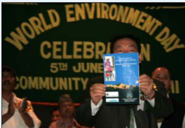
World Environment Day 2006: Hon'ble CM releasing books on Ecological Studies