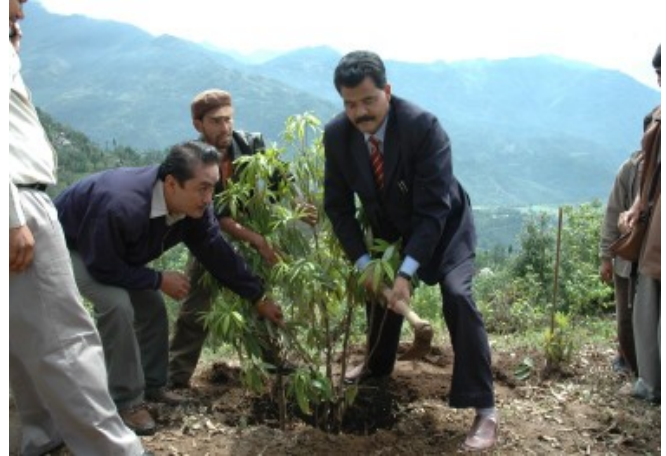
State Green Mission: Plantation by Hon'ble Minister (Forests) Mr. S.B. Subedi