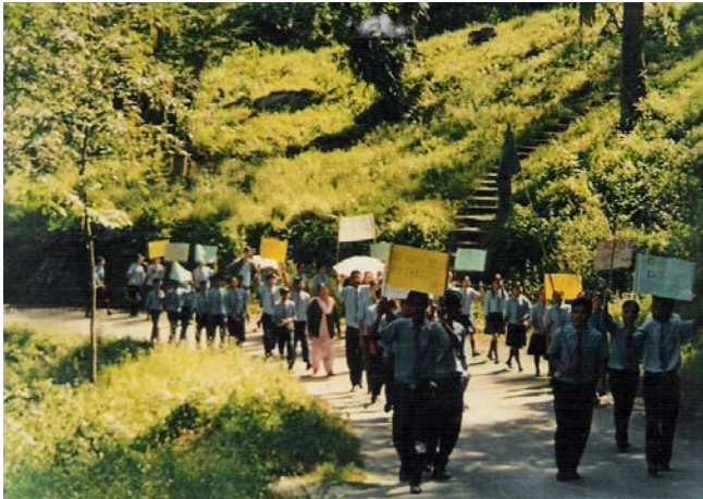
Students performing rally on Environmental Awareness