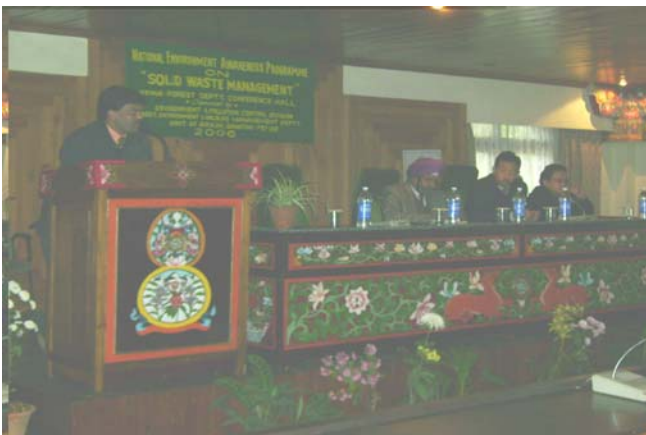
DFO (EPC) delivering the needs of Solid Waste Management