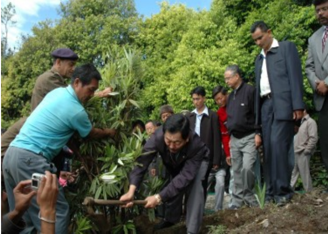
State Green Mission: Plantation by Hon'ble Chief Minister Dr. Pawan Kr. Chamling