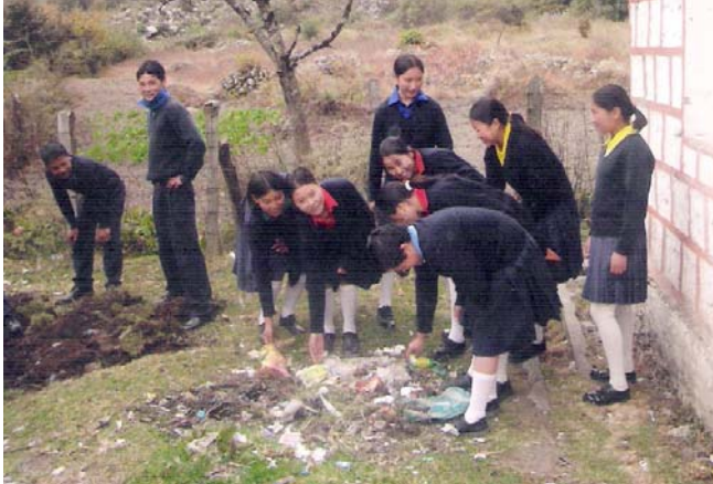
Solid Waste Management:: Students in action