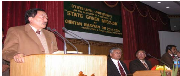
Launching of Sikkim Green Mission on 27 th February 2006

spread recognition of Sikkim being a Green State. The Hon'ble Chief Minister Mr. Pawan Kr. Chamling formally launched this Mission on 27 th February 2006 in the presence of all Ministers, officers and the public of Sikkim.