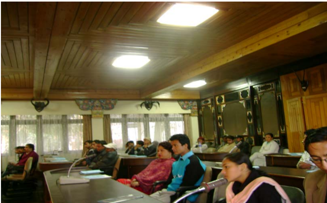
Snapshot : Attendance of Shopkeepers and Hotel owners of Deorali on the programme