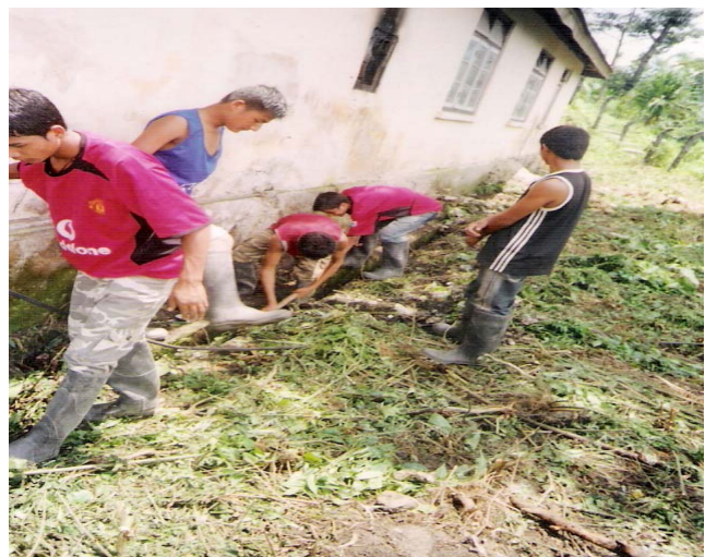
Volunteers Cleaning the School Premises