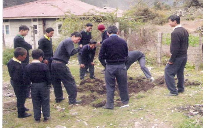
State Green Mission: Students in action