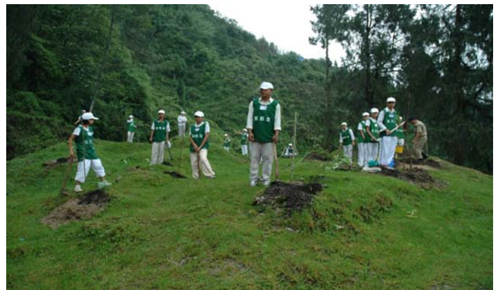
State Green Mission : Students and Volunteers in action