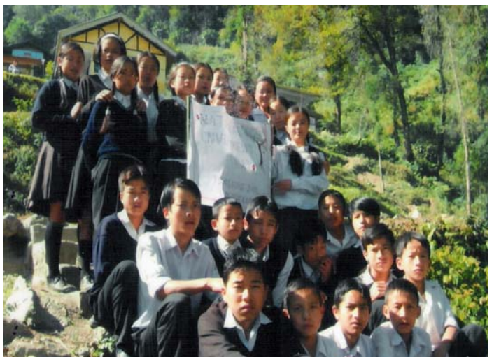
Environmental Awareness: Students of Tumlong Jr. High School in action