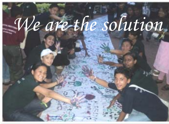
Students preparing the nation's longest hand print eco-banner

The activities of National Green Corps programme being implemented by school eco-clubs and coordinated by the ENVIS Centre under Forest, Environment & Wildlife Management Department for stimulation of environment awareness has been appreciated as the Greenest of Greens in the first ever National Conference of Children and Youth held at Hyderabad, Andhra Pradesh from Aug 25-30, 2010 where 21 States participated.