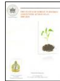
Compilation of the status of forest nurseries and future action plan 2009-2010