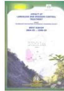
Treatment of Landslide and Erosion Control in West Sikkim