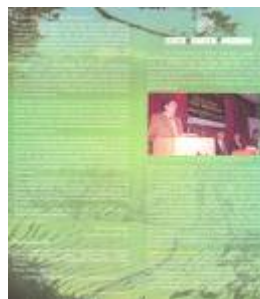
State Green Mission Pamphlet