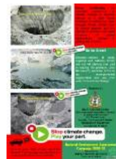
Climate Change Pamphlet