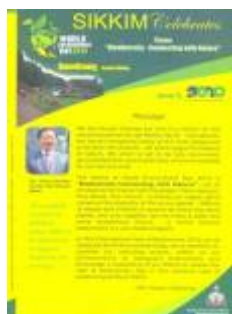
World Environment Day 2010