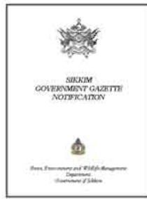
Compilation of Gazette Notifications on forest, env. & wildlife