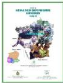
National Green Corps Programme in North Sikkim