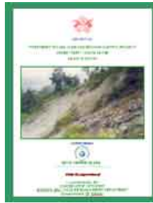
Treatment of Landslide and Erosion Control in South Sikkim