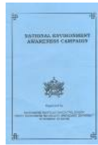
National Environment Awareness Campaign on Solid Waste Management