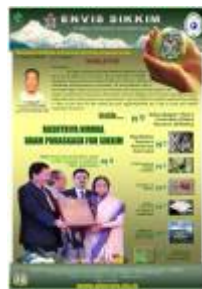
Vol 2. No. 1