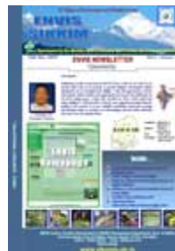
Vol 1. No.2