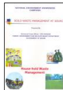
Solid Waste Management Booklet