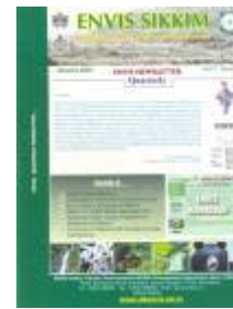
Vol 1. No.1