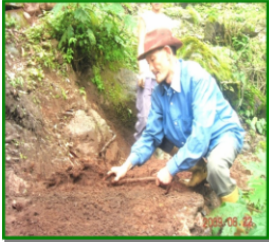
laborers employed in nurseries