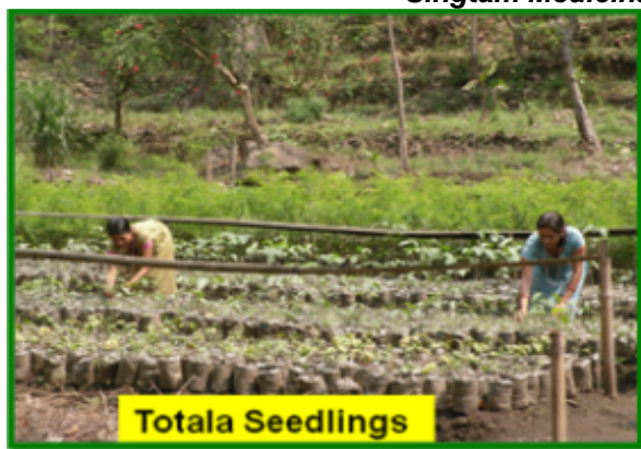
Singtam Medicinal Plants Tree Species Nursery