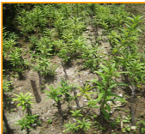
Achuk seedlings propagated through cuttings