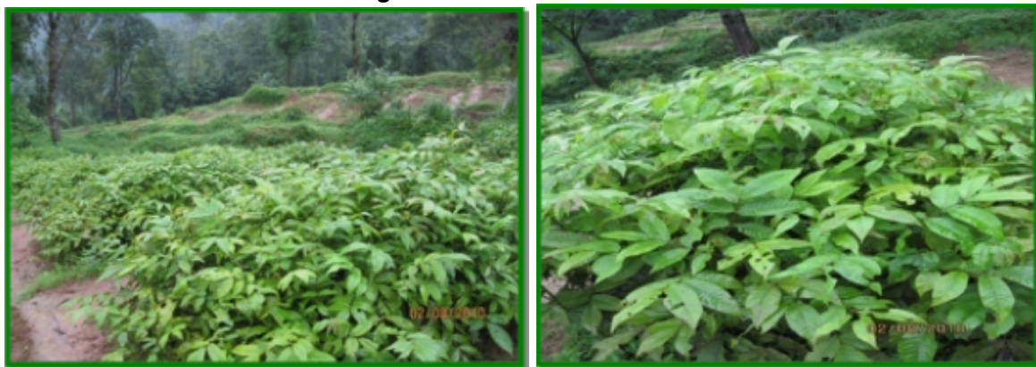
Wildfruit trees seedlings(Okhar) raised at Pangthang Nursery during 2009-2010 under TSP scheme