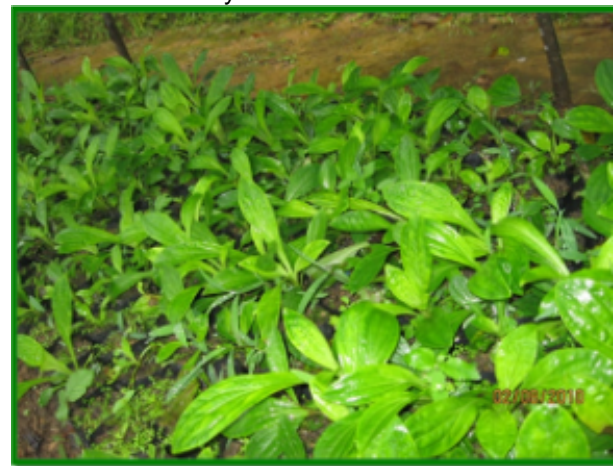
Chiraita seedlings raised in the nurseries