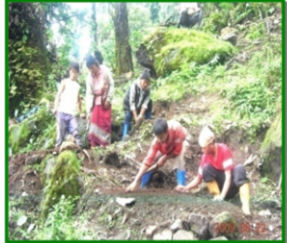
laborers employed in nurseries