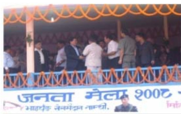
Distribution of financial assistance to contractual farmers during janta mela 2008 by the Hon'ble Chief Minister Shri Pawan Chamling