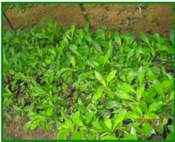
Chiraita seedlings raised in the nurseries